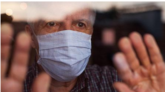
Healthcare Facilities Set Up Outdoor Visits for Elderly Patients