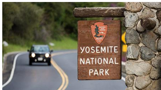
U.S. Commits Billions to National Park Maintenance